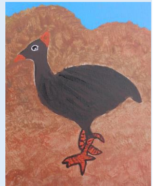
Yinya yala Muruku